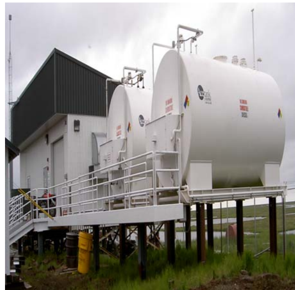
Figure 1: Kongiganak Power Plant

925 Plum St SE, Bldg 4 • P.O. Box 43165 • Olympia, WA 98504-3165 (360) 956-2004 • Fax (360) 236-2004 • TDD: (360) 956-2218