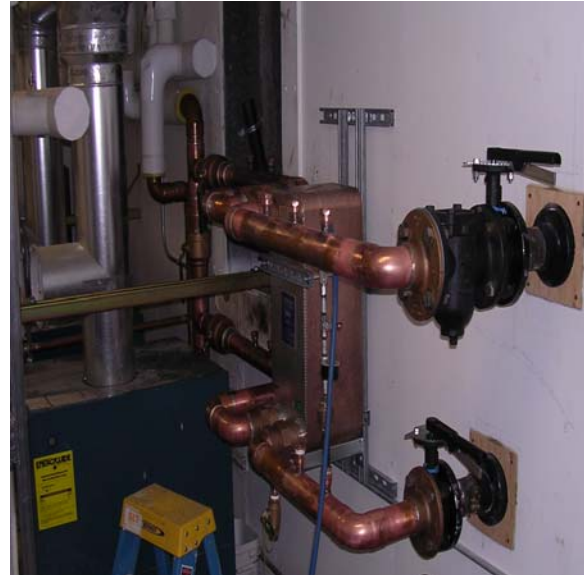
Figure 3: Heat Recovery System

When generators are ready for replacement, consideration should be given to installation of marine manifold units of similar capacity to increase the amount of jacket water heat available for recovery.